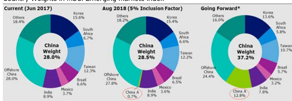
Country Weights in MSCI Emerging Markets Index