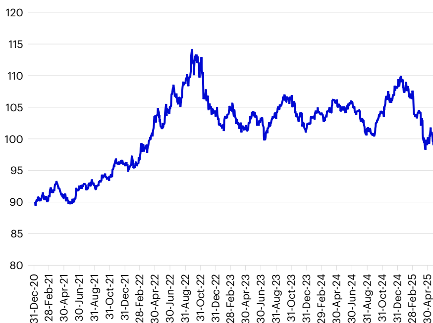
Figure 1: US Dollar Index (December 2020 - May 2025)