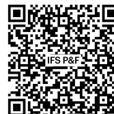
Prospectus and Financial Reports