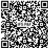
Prospectus and Financial Reports