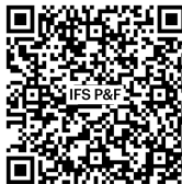
Prospectus and Financial Reports