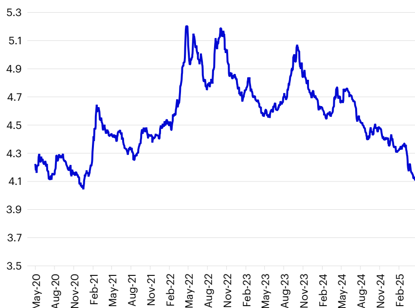
Figure 2: J.P.Morgan GBI-EM Broad Diversified Asia Yield to Maturity (% p.a.) (May 2020 – May 2025)

Data as of 19 May 2025. Note: GBI-EM refers to Government Bond Index – Emerging Markets.