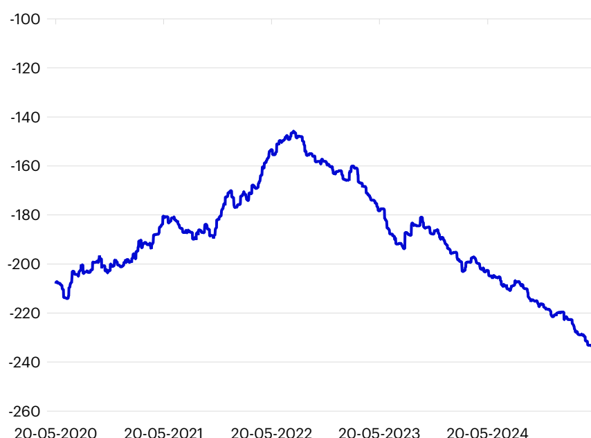
Figure 3: HSBC Pan-Asia Inflation Surprise Index (May 2020 – May 2025)

Data as of 19 May 2025. Note: This index tracks the degree to which inflation data in Asia has been coming in higher or lower than expectations. The indices cumulate standardized surprises in scheduled inflation data releases. A positive trend to the index indicates that inflation data has been coming in, on average, higher than expected. A negative trend in the index indicates that inflation data has been coming in lower than expected. Data is included from the following countries/regions: Hong Kong, China, Taiwan, South Korea, Malaysia, Singapore, Philippines, Thailand, India, Indonesia.