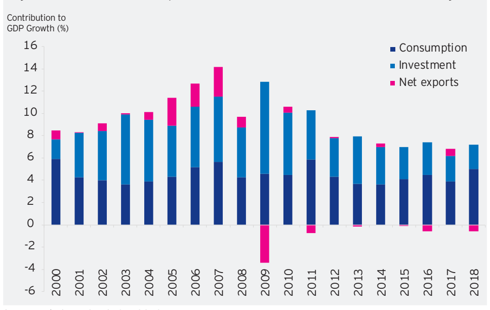
Figure 2: Domestic consumption's contribution to China's GDP is increasing

More importantly, drivers behind mainland China's real economic growth are different from other major emerging-market economies, with domestic consumption accounting for 76.2% of GDP growth in 2018 (figure 2).<sup>4</sup> In comparison, other key emerging-market economies are more exposed to global trends: South Korea and Taiwan depend on exports for economic growth, while commodities drive the economic growth of South Africa, Brazil and Russia. All these mean that China's economic, business and monetary cycles are less in sync with global ones.